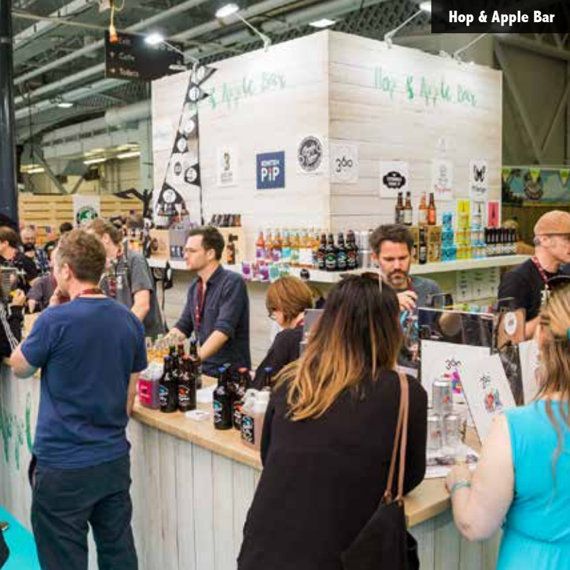
Hop & Apple Bar